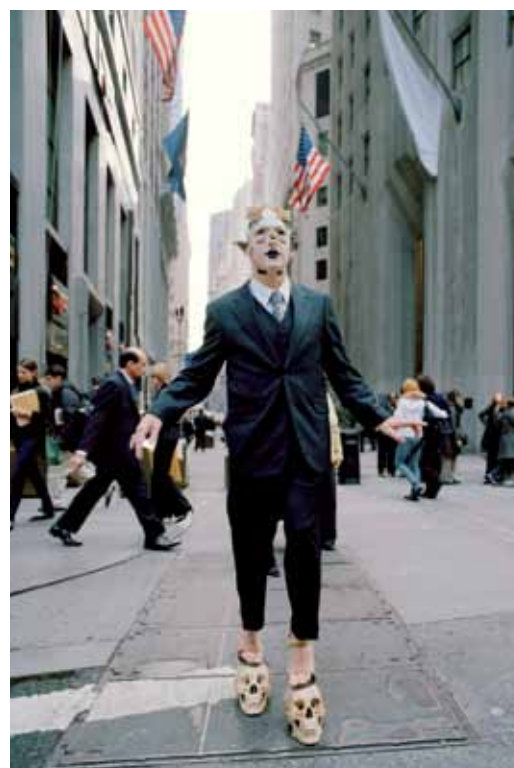
4 Steven Cohen, Video still from Golgotha series and performances: Wall Street (2009). DVD, 1-channel video (exhibition copy).

who exclaims on seeing the three 'men of sin' for the first time: 'How beauteous mankind is! O brave new world / That has such people in't!' Prospero's cynical reply is: 'Tis new to thee.' (V i 186–188. Shakespeare 1997: 3102). These lines encapsulate both the naïve vision of utopia and the realistic observation that a superficial understanding of utopia belies its really being dystopic.