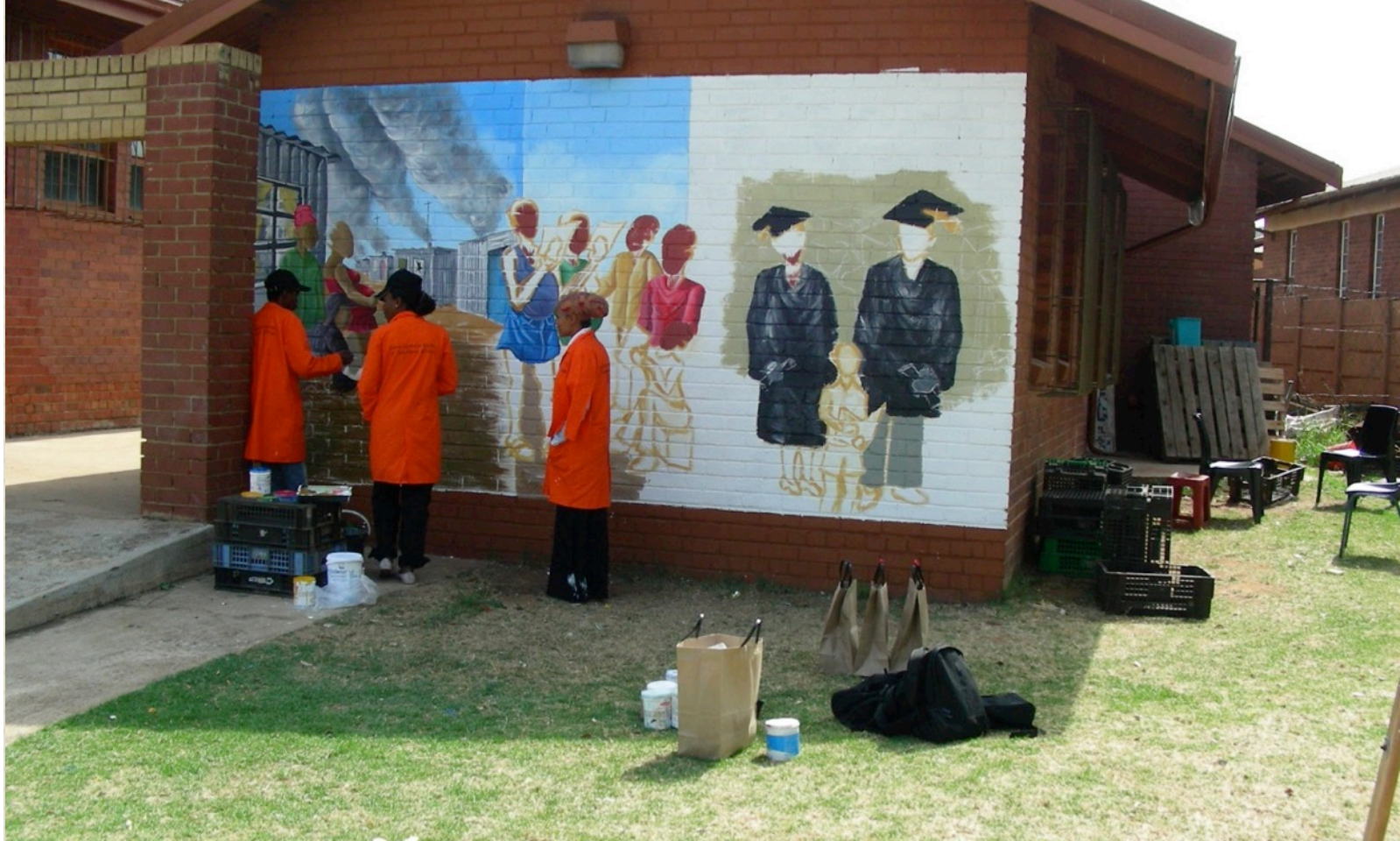
MURAL 1: COMMUNITY HALL