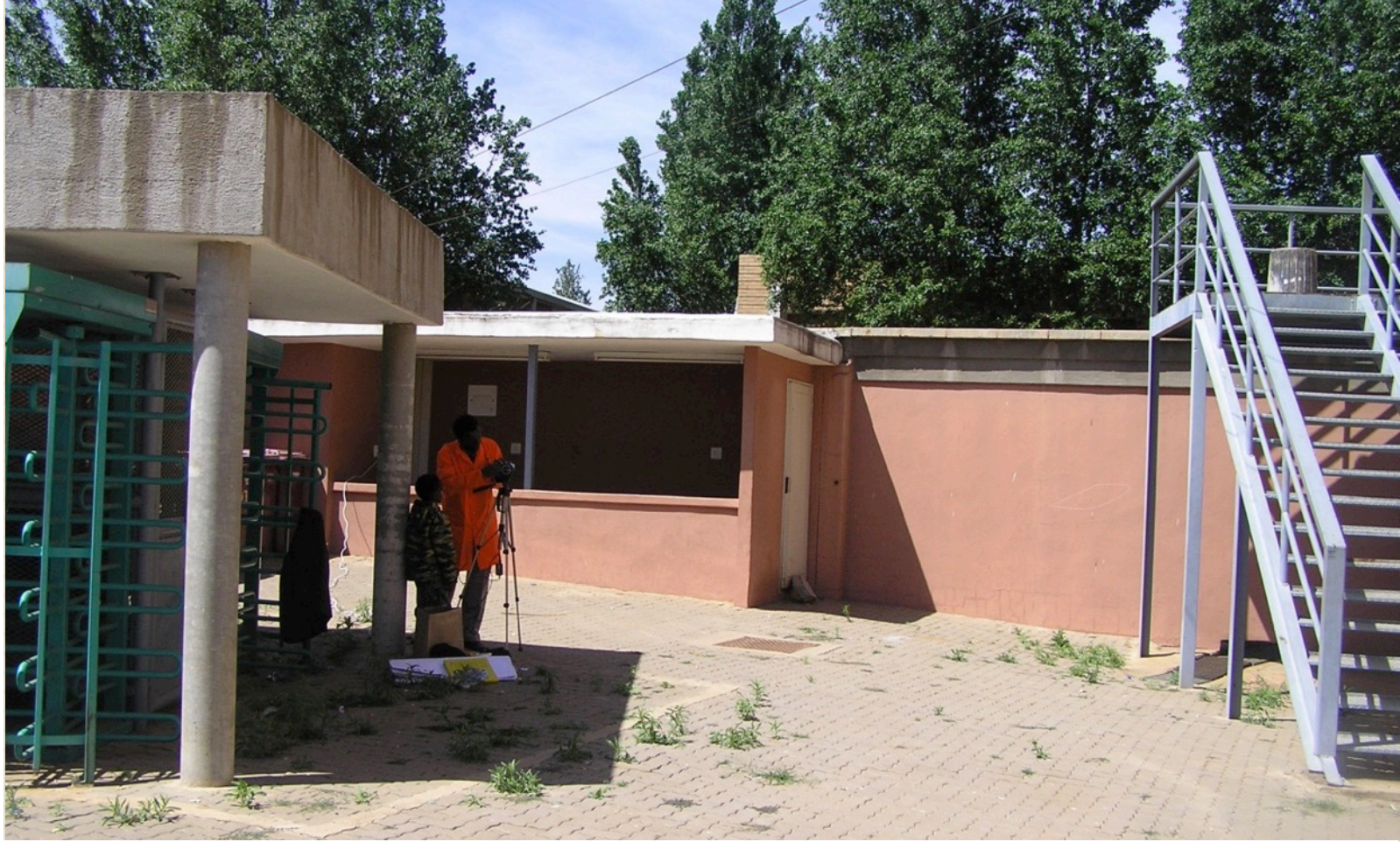
MURAL 5:TITUS MATIYANE