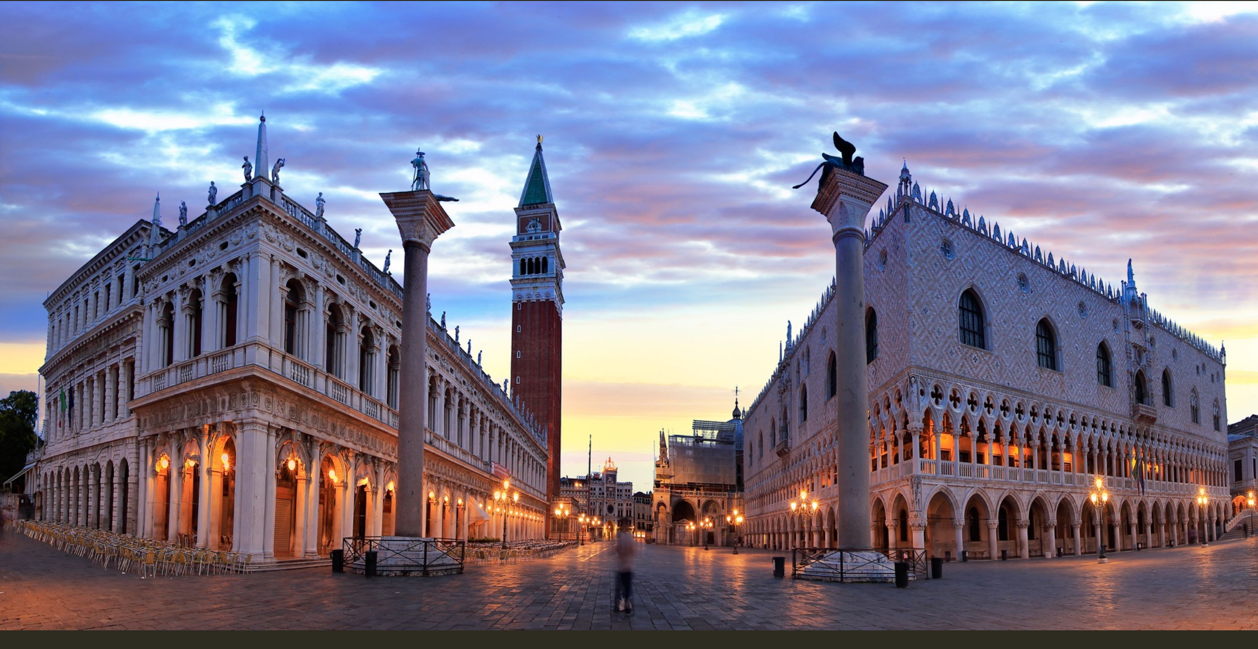
Palazzo San Marco and Doge's Palace