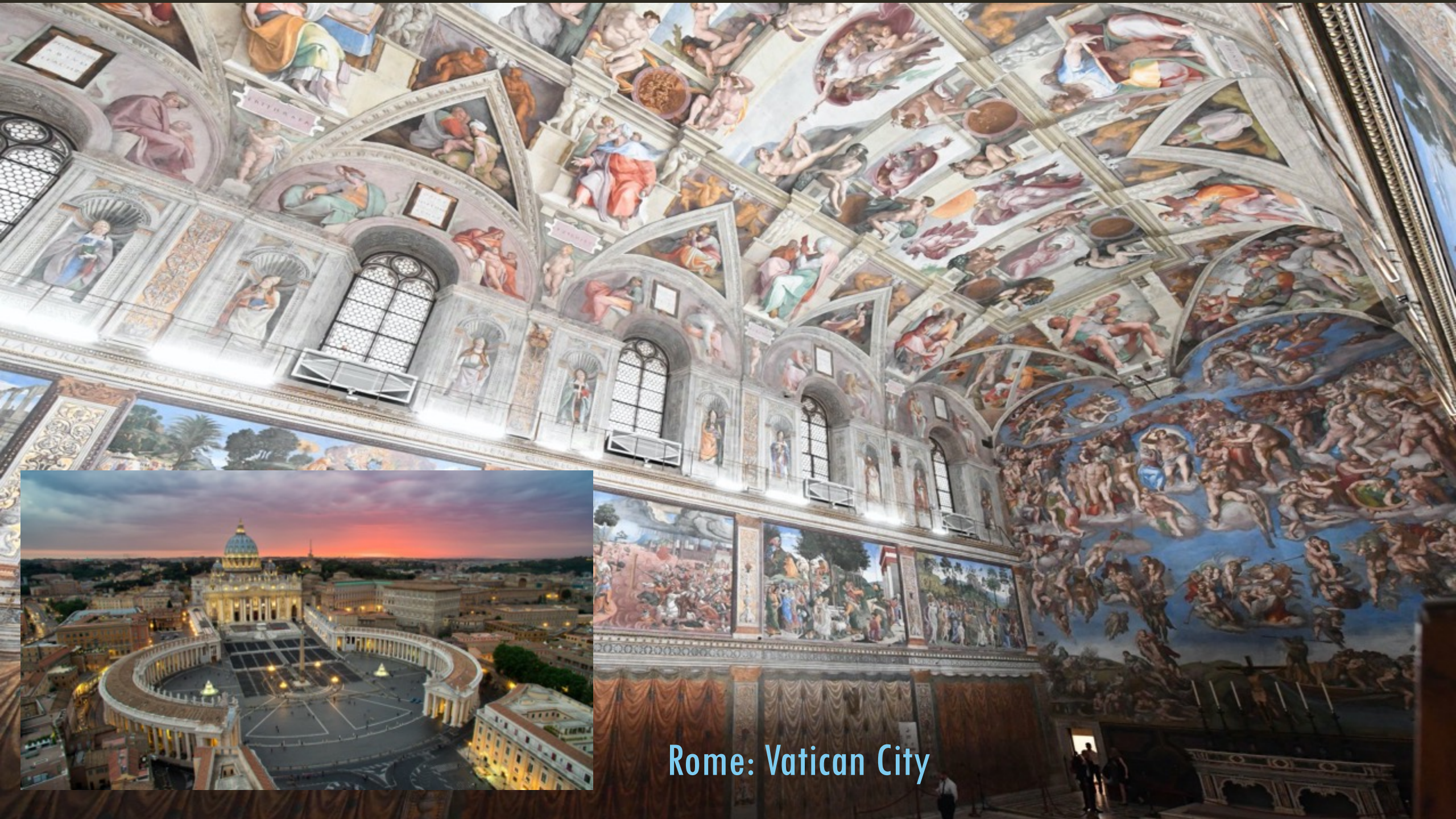
Rome: Vatican City