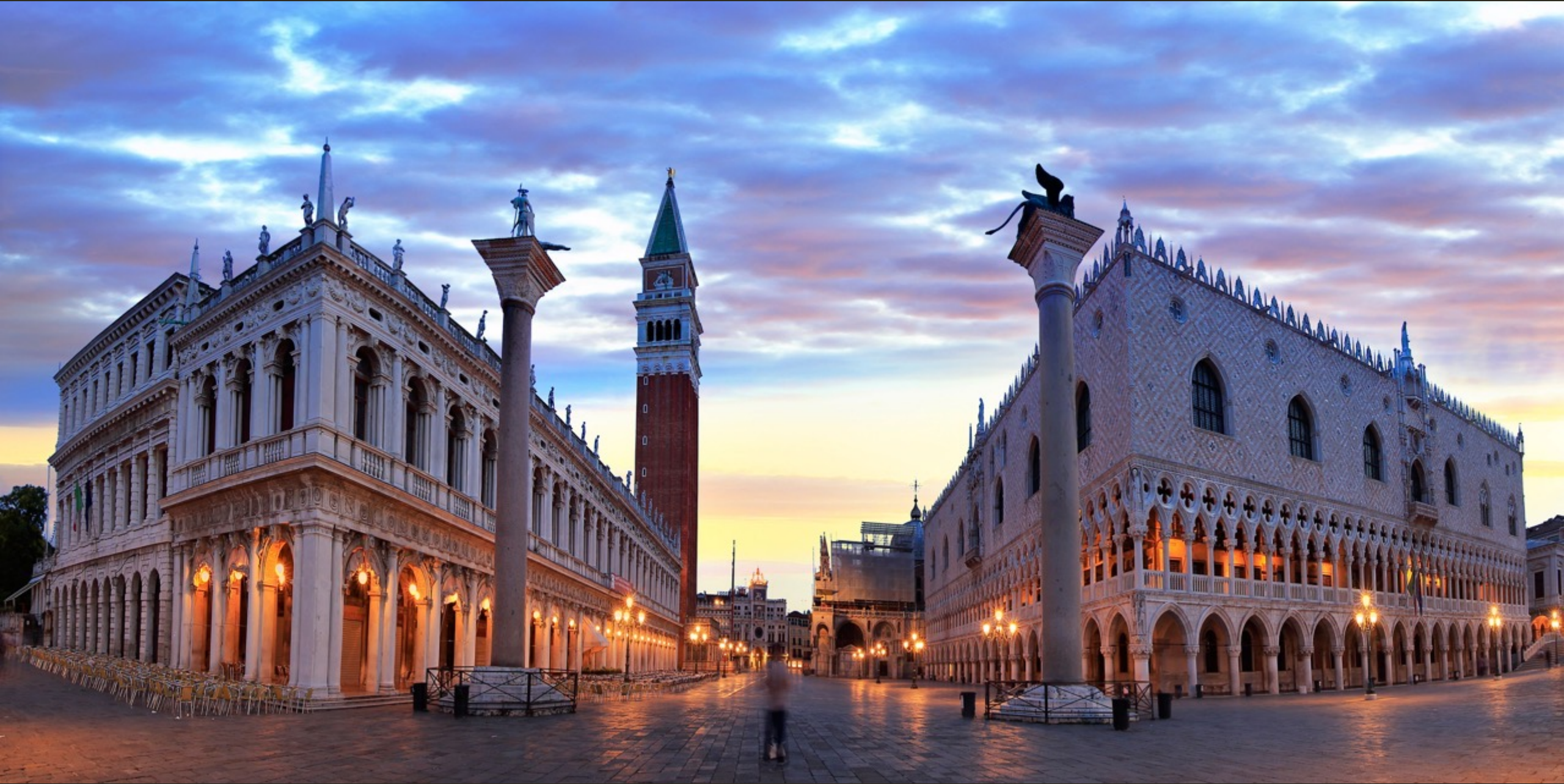
Palazzo San Marco and Doge's Palace