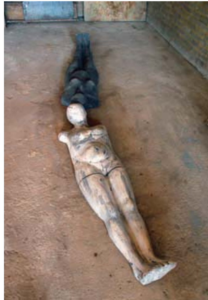
Wilma Cruise, Sarcophogi 1 (2007).