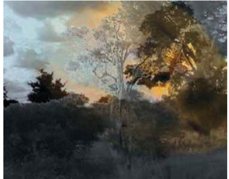
Elfriede Dreyer, delta 32 (2005). Manipulated video still.

The animals in conflict represent and intermingle recollections of South African political and social turmoil with personal trauma, challenges and confrontations. Besides the buck imagery, the quivering road of memory also evokes images of giraffes and cheetahs that respectively represent existential Being in the world, fear and aggression. The depiction of the giraffe recalls Dali's burning giraffe 13 that allegedly refers to the Spanish Civil War.