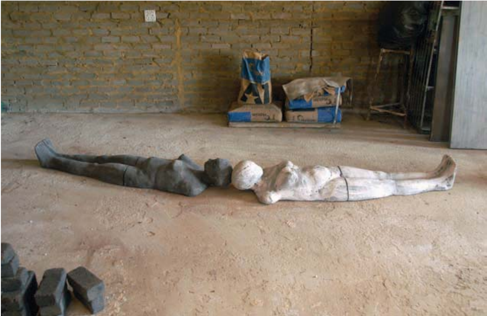
Wilma Cruise, Sarcophogi 1 (2007). Ceramic and limestone.