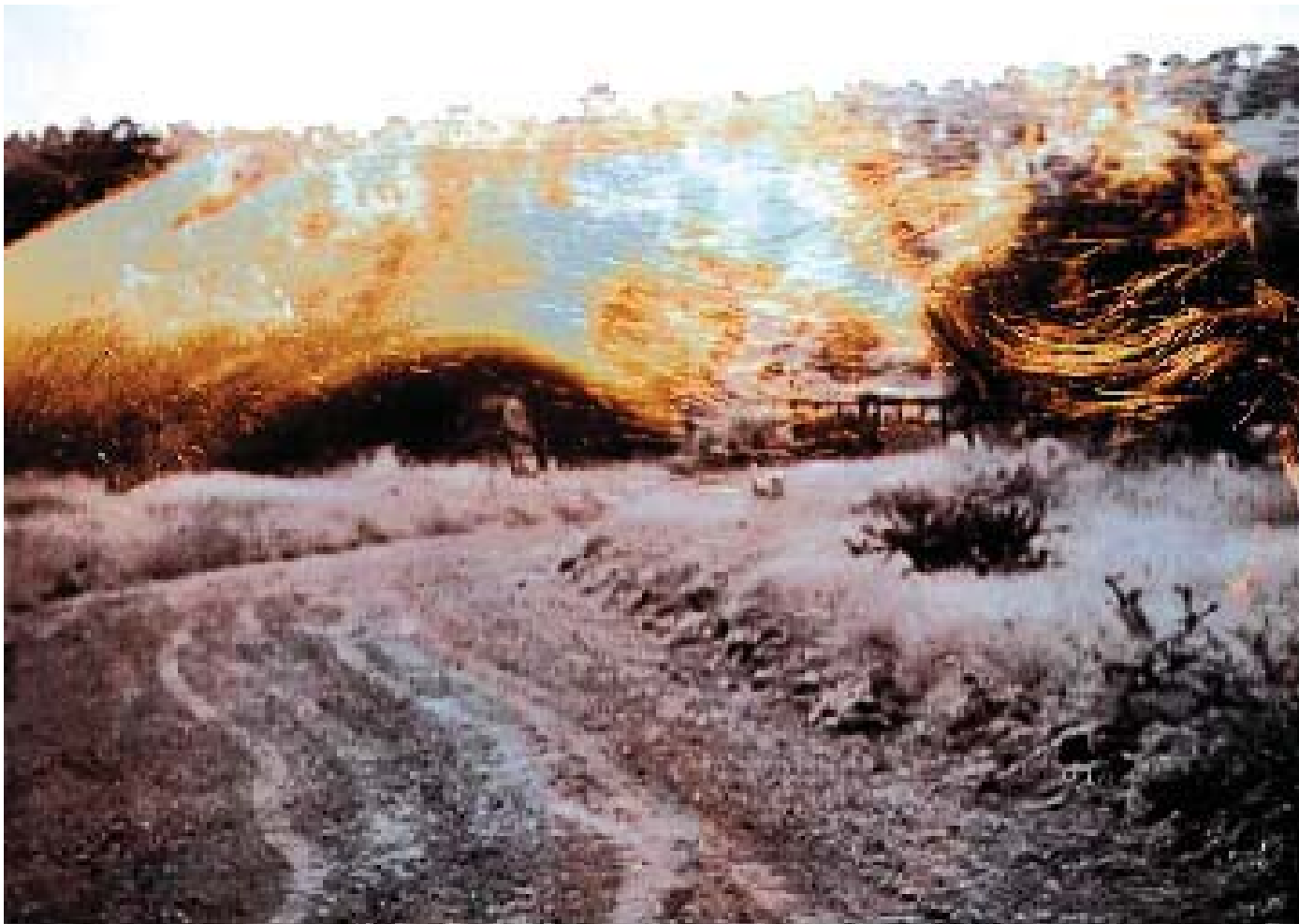
Dreyer, delta 46 (2007). Manipulated video still.