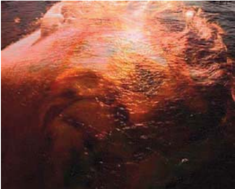
Elfriede Dreyer, delta 26 (2005). Video still.

The title of Little deaths furthermore represent the poststructuralist notion of 'death-of-the-author'. In 1967 French literary critic Roland Barthes postulated that, in the interpretation and understanding of any text, the author is dead 6 . In ambiguous way, the author-artist is 'in' the text only insofar as we try to read him/her 'out' of it.