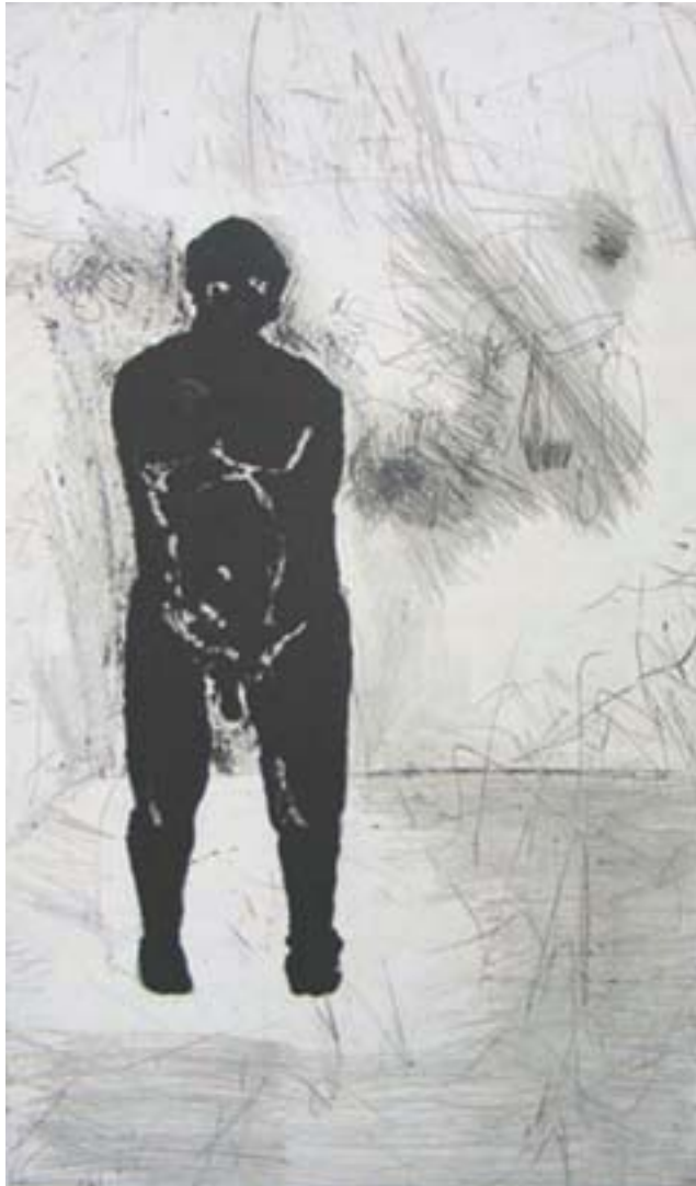
Wilma Cruise, Mother goose 1 (2006). Etching 2/10.

For Derrida (1976:163) interpretation (and the search for truth) is a nostalgic quest which leads to continuous temporal frameworks or parerga that are continuously drawn and deconstructed. As a result, in poststructuralist terms, every work is 'eternally written here and now' with each re-reading, because the origin of meaning lies exclusively in language itself and its impressions on the reader. According to John Lye (2000 [sp]), "We get caught in a fruitless circle".