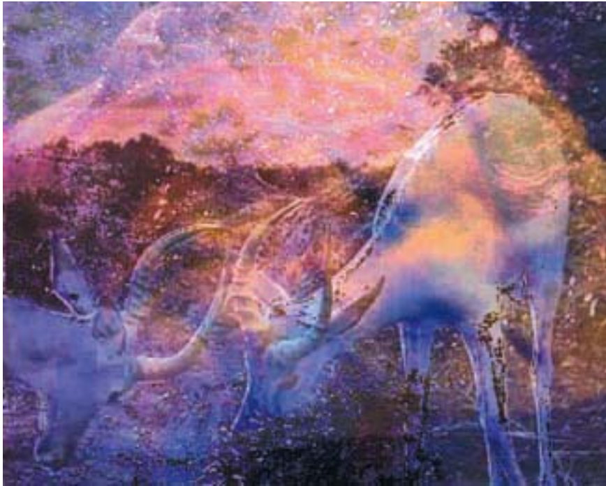
Elfriede Dreyer, delta 14 (2005). Manipulated video still.

The two heads are replicated in the images of the two red buck engaged in head bashing, expressing the constant conflict between the id and superego, related to basic sexual and aggressive drives.