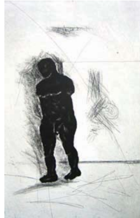
Wilma Cruise, Mother goose 2 (2006). Etching 2/10.

Cruise's bodies operate in the domain of the unconscious, which, according to Lacan, is the ground of all Being and like a continually circulating chain (or multiple chains) of signifiers, with no anchor – or, to use Derrida's terms, no centre. Theorists have given many other names to centre; in Lacanian theory it is the Other, but it's also called the phallus.