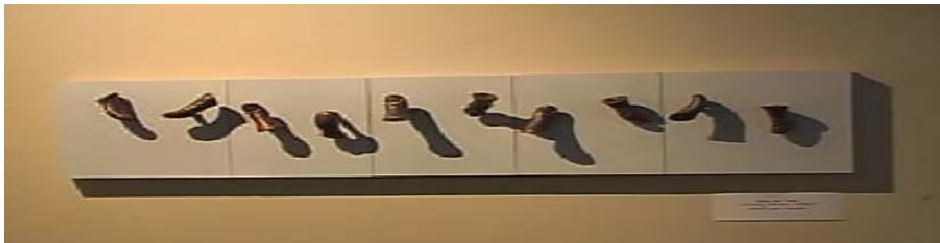
Guy du Toit Thumbs 2005 Bronze