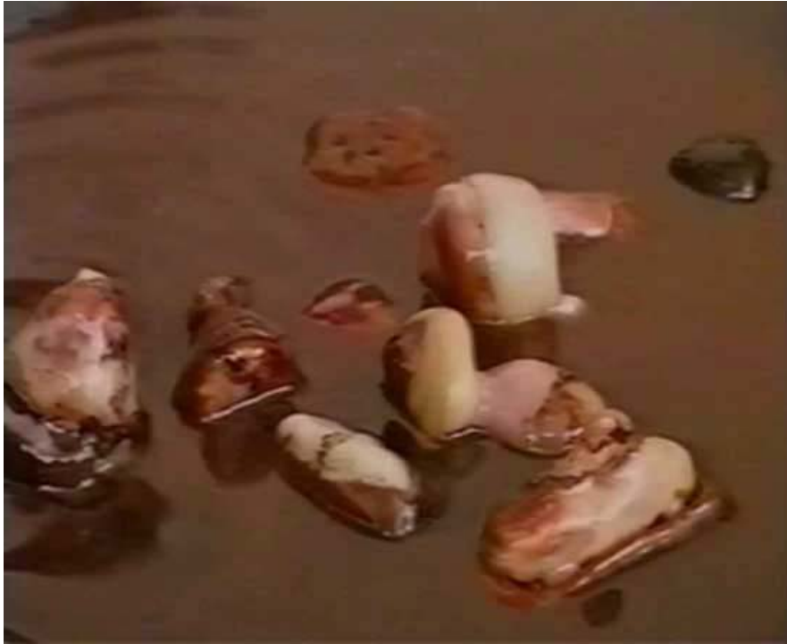
Leora Farber Corpus Delicti 2001 Video production