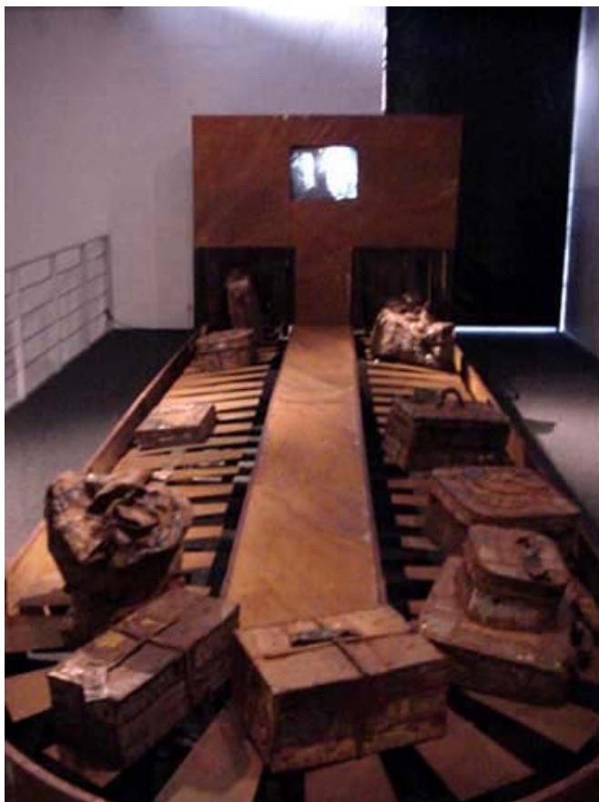
Jan van der Merwe Baggage arrival 2002 Found objects, rusted objects, TV monitors