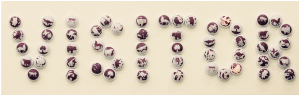
Adèle Oldfield, Visitor , 2009. Mixed media, 910mm x 2740mm, each 130mm diameter.